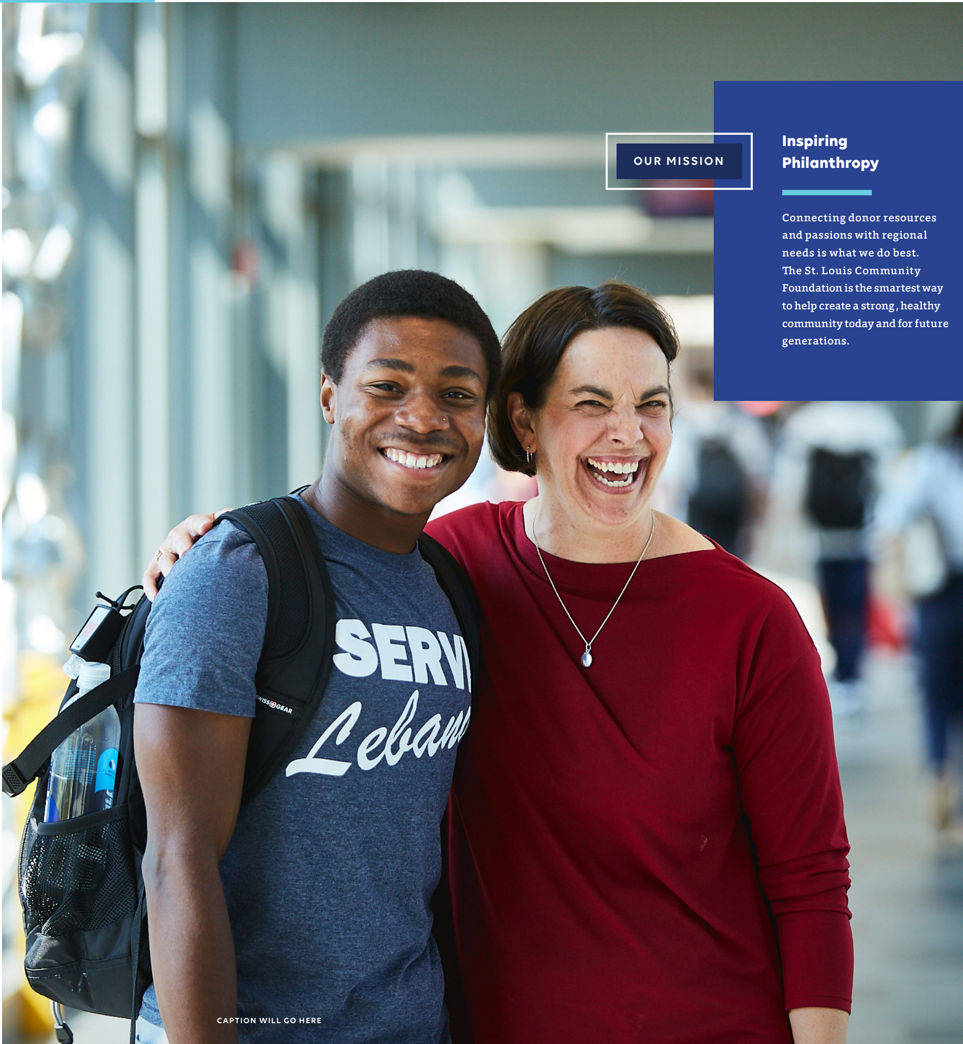
CAPTION WILL GO HERE

Connecting donor resources and passions with regional needs is what we do best. The St. Louis Community Foundation is the smartest way to help create a strong, healthy community today and for future generations.